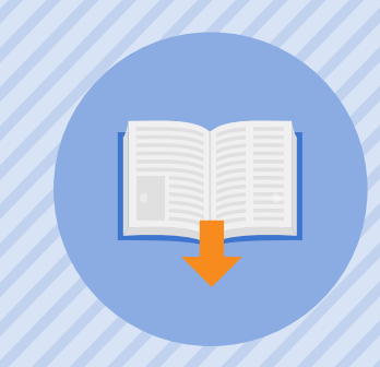
Access to e-books

An EBSCO user research study found that library users would use a mobile app for research on-the-go.