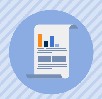
Save quick hits of information for longer research projects