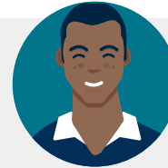
Marcus University Student