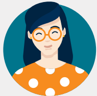
Keiko High School Student (College-Bound)