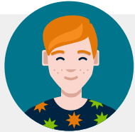
Liam Elementary School Student

Click on a persona below to learn more about how LearningExpress can help them achieve their unique goals.