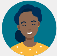
Lucy Middle School Student